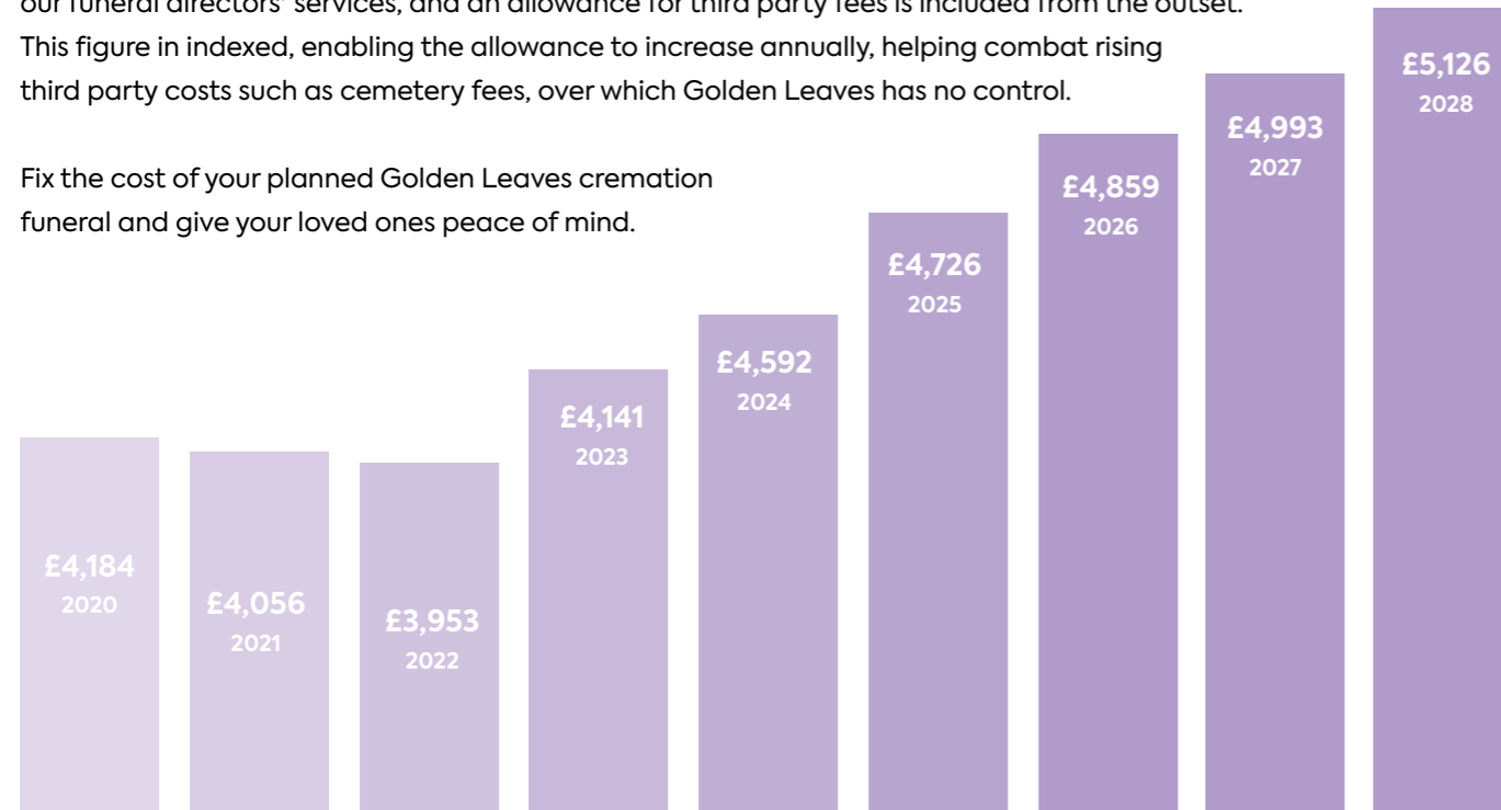
Funeral cost projected from 2020 until 2028

Fix the cost of your planned Golden Leaves cremation funeral and give your loved ones peace of mind.